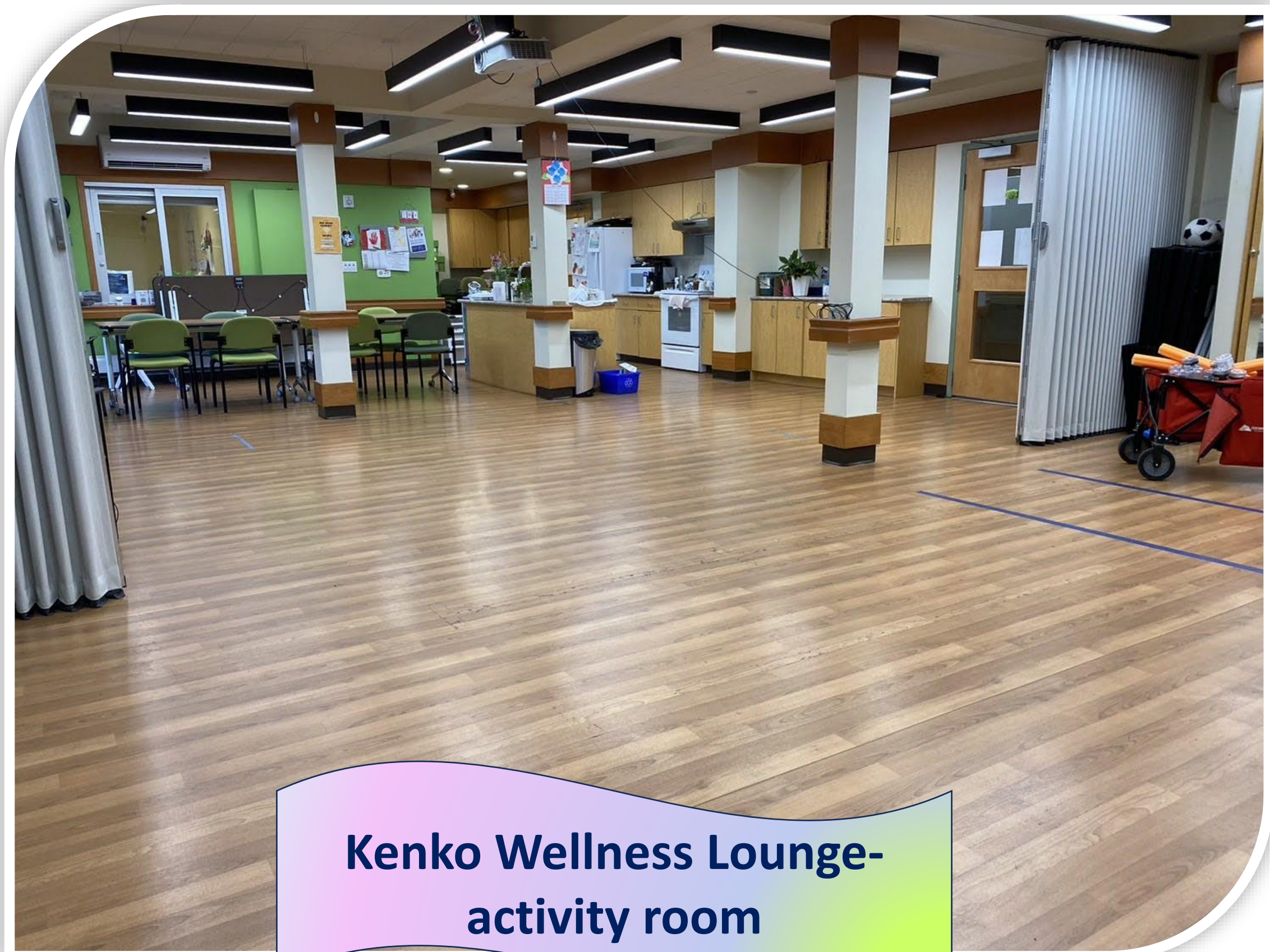
Kenko Wellness Lounge- activity room